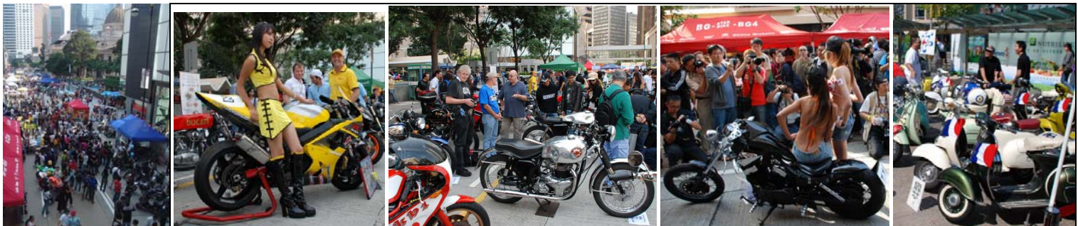
1.0 Numerous activities and Biking attractions at the previous Shows

As in 2006 and 2007, the Show aims to be a mixing of every aspect of Motorcycling in Hong Kong from the ‘Harley Hogs’ to the Moto-Crossers, from the Police Bikes to Superbikes! Everything you need to know about Biking in Hong Kong will be on Chater Road on 2 nd November, 2008. This is an opportunity for Bike Shops and Clubs to show themselves to the HK Community!